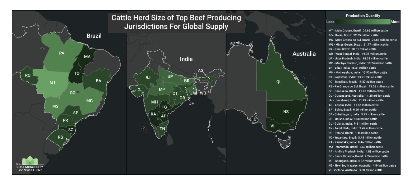
Figure 1. Sample model output for top producing jurisdictions for global supply.